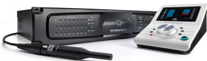
Intonato 24 shown with included microphone and optional Intonato Desktop Controller